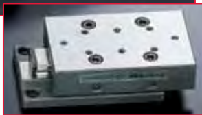
BWU (Precision Linear Slide Unit)