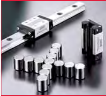
LRX Linear Roller Way Super X Track Rail Width: 10mm to 100mm