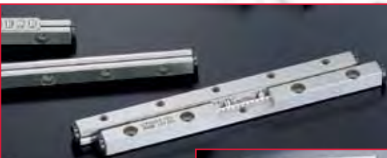
CRWG CRWUG (Anti-Creep Cage Crossed Roller Way and Crossed Roller Way Unit)