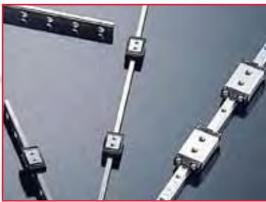
LWL (Linear Way Miniature) Track Rail Width: 1mm to 25mm