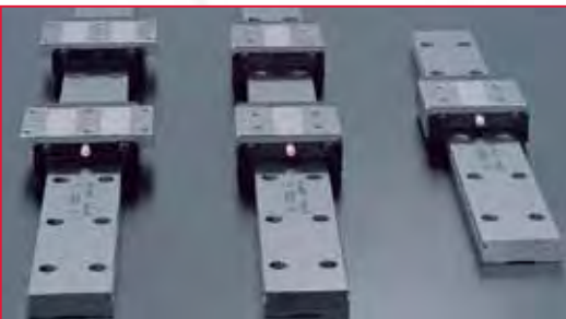
LWFF LWFS (Wide Rail Type Linear Way) Track Rail Width: 33mm to 69mm